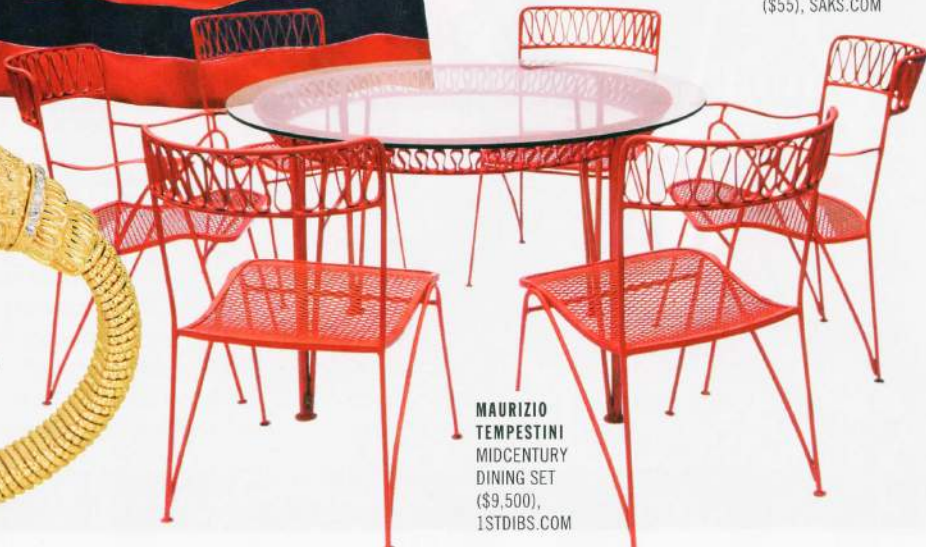
MAURIZIO TEMPESTINI MIDCENTURY DINING SET ($9,500), 1STDIBS.COM