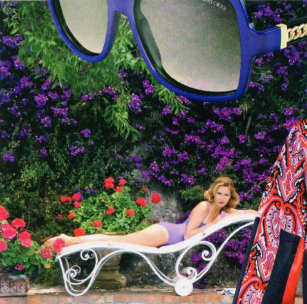
SUMMER PLANS Slim Aarons captures Princess Pia Ruspoli by a swimming pool in Capri, 1980.