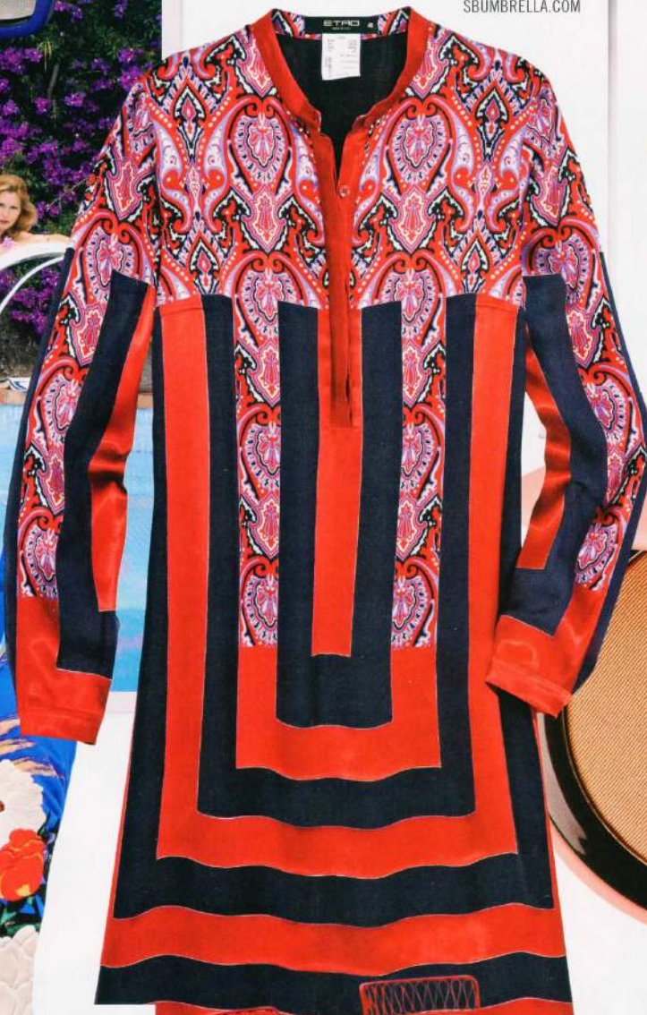
ETRO DRESS ($2,214), ETRO.COM