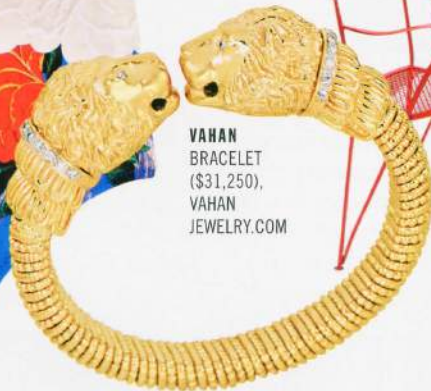
VAHAN BRACELET ($31,250), VAHAN JEWELRY.COM