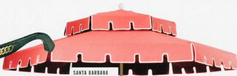
SANTA BARBARA DESIGNS UMBRELLA ($4,299), SBUMBRELLA.COM