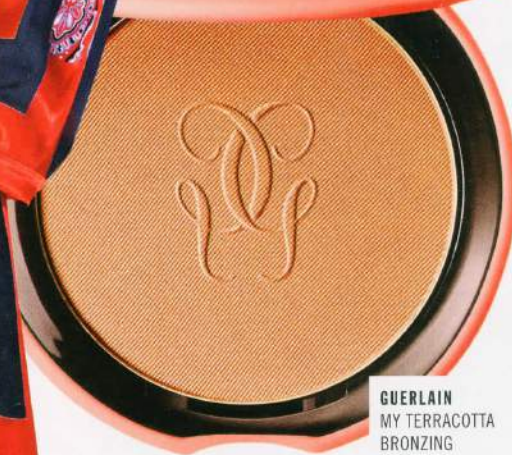
GUERLAIN MY TERRACOTTA BRONZING POWDER IN NO. 3 ($55), SAKS.COM