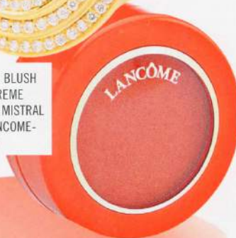
LANCÔME BLUSH SUBTIL CREME IN ROUGE MISTRAL ($24), LANCÔME- USA.COM