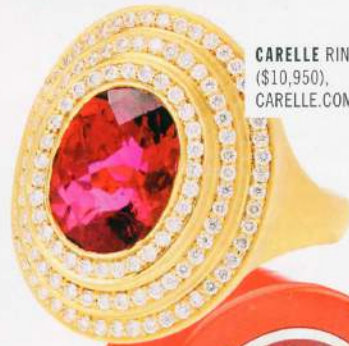
CARELLE RING ($10,950), CARELLE.COM