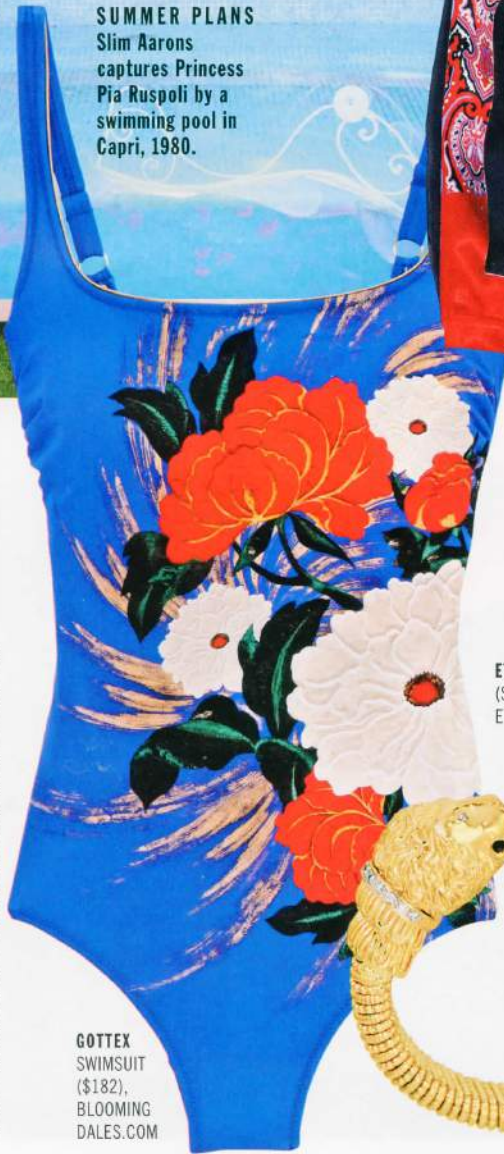
GOTTEX SWIMSUIT ($182), BLOOMING DALES.COM