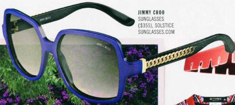
JIMMY CHOO SUNGLASSES ($355), SOLSTICE SUNGLASSES.COM